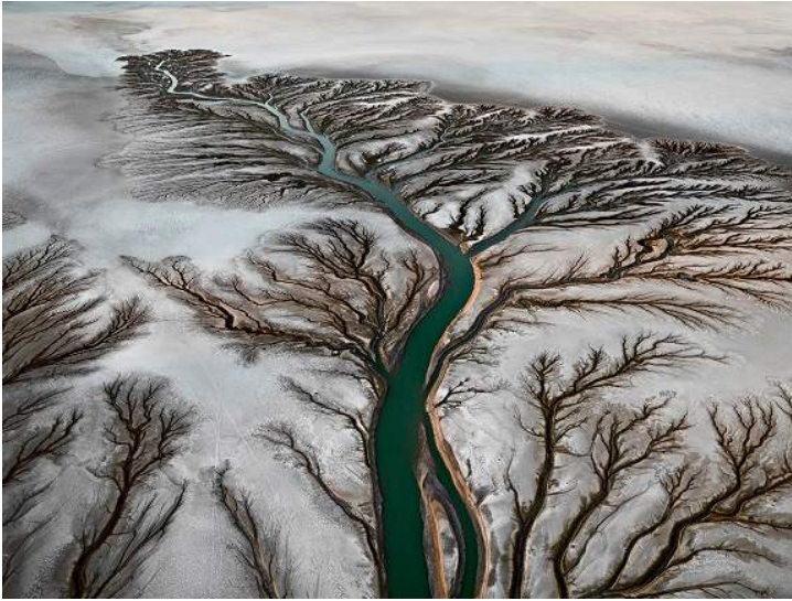
Watermark by Jennifer Baichwal, Edward Burtynsky, 2013