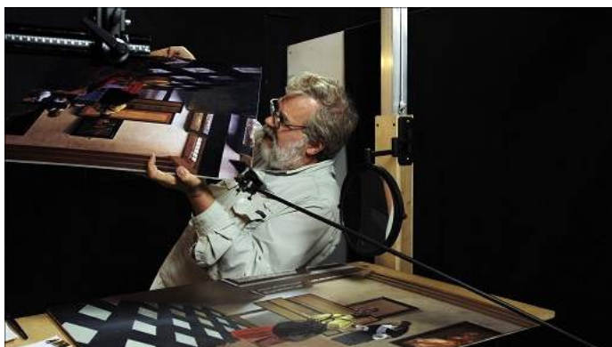
Tim's Vermeer by Teller, USA, 2013