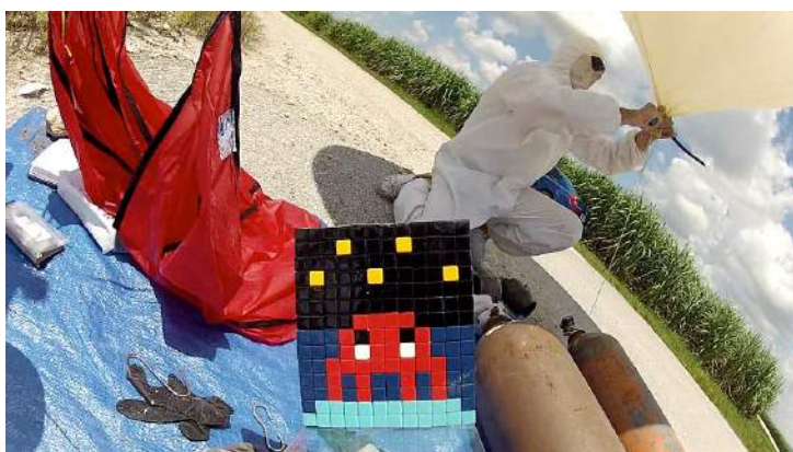
Art4Space by Invader, Francia, 2012

Among the Italian premieres, Zachary Heinzerling's Cutie and the Boxer (nominated for an Oscar), the story of the chaotic life of Japanese artists Ushio Shinohara and his wife Noriko "Cutie", who've lived in New York as outsiders for over 40 years; Art4Space , in which the French street-artist Invader, known for having created the characters inspired by the video game Space Invaders, formed by small colored tiles arranged in mosaics, that have invaded public spaces around the world, sends one of his works into outer space;