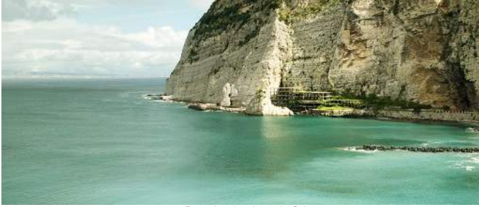
Dom-ino by Joseph Grima