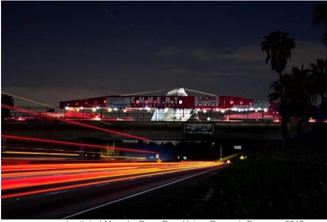
Levitated Mass by Doug Pray Heizer Reservoir Overpass 2012