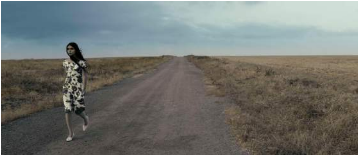
Faezeh by Shirin Neshat, 2008